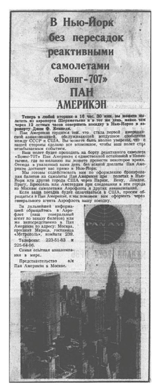
Figure 3. "To New York without Transfer on the Boeing 707 Jets of Pan Am," Vecherniaia Moskva , February 10, 1969