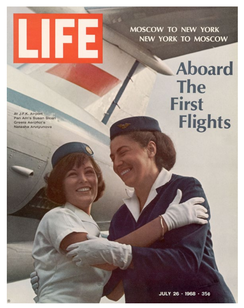
Figure 1. Cover of Life magazine, July 26, 1968.

In the Soviet context, strict restrictions on foreign travel were a political decision that curtailed the market that international airlines could access within the USSR. In the US, the absence of political restrictions on citizens' travel opened a vibrant market for travel agencies, as well as Pan Am and Aeroflot, to capture their business. Aeroflot had access to that market, allowing it to operate like an ordinary airline corporation. In contrast, Pan Am had little access to the Soviet economy and could not act like a Soviet enterprise since doing so would have meant becoming part of the Soviet state. Pan Am also lacked inside the USSR the informal networking that Samorukov enjoyed through émigrés from Russia and local businesses in New York. Advertising was an early indication that such barriers to the Soviet political economy were simply too high for Pan Am to overcome but created opportunities Aeroflot could leverage.