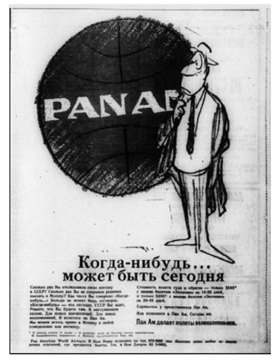
Figure 4. "Kogda-nibud' ... mozhet byt' segodnia," Novoe russkoe slovo (New York City), April 26, 1970

Such problems with advertising were corroborated by Pan Am executive George Hambleton (2011), who helped establish the route to Moscow, when he later recalled that their advertising amounted to calendars and what they put in Pan Am's window at the Metropol Hotel. Interestingly, JWT had shared with Hambleton the ad that did