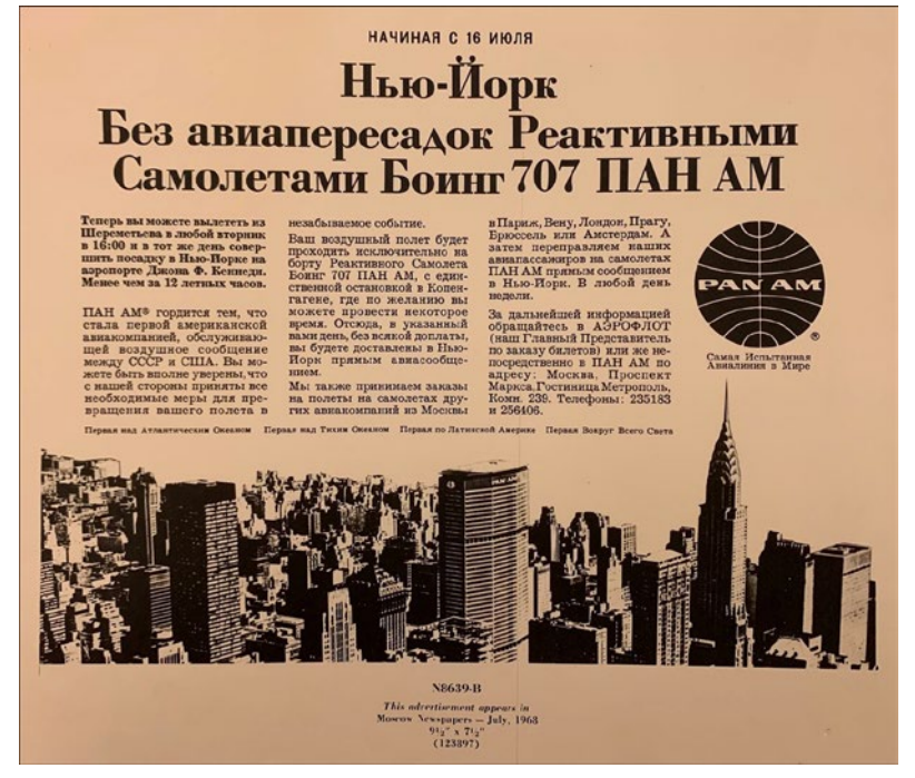
Figure 2. "Starting July 16, New York without Changing Planes on Pan Am's Boeing 707 Jets."<sup>48</sup>

For example, a Russian-language ad, drafted in March 1967, featured an airplane flying above the New York City skyline with a headline that boldly proclaimed, "Starting May 1, Pan American Airways will fly nonstop between Moscow and New York." Its copy celebrated the flight's nine-hour direct route but helpfully pointed out that "we can fly you any day of the week to New York from most major European cities (via connecting carrier from Moscow). Either way, you'll enjoy cuisine by the famous restaurant, Maxim's of Paris , and a movie* and stereophonic music" (emphasis in the original). Echoing such convenience, the Russian-language ad "Starting July 16, New York without Changing Planes on Pan Am's Boeing 707 Jets" (see figure 2) invited Soviet passengers to take advantage of the layover in Copenhagen, "where, if you wish, you may spend some time. From there, on any day you choose, Pan Am will fly you directly to New York at no extra cost."