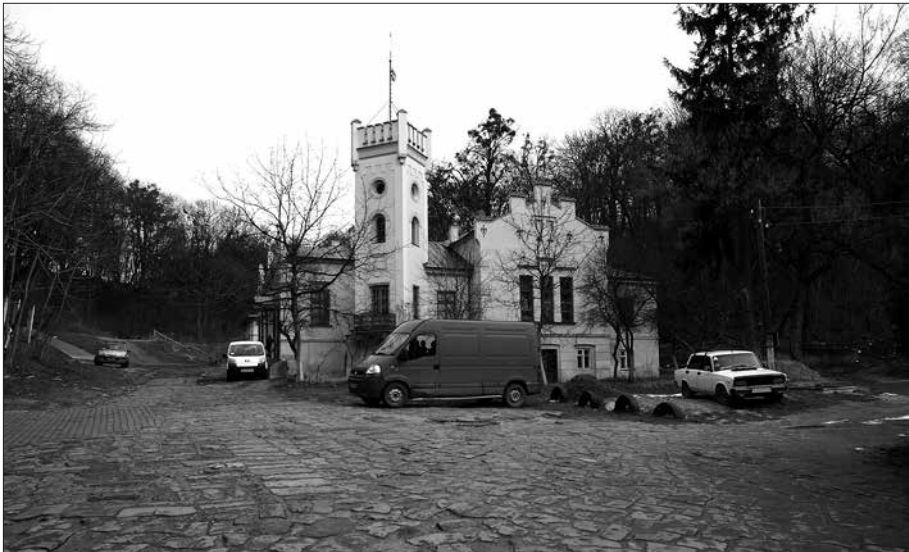
Figure 4. Museum of the Liberation Struggle of Ukraine, 2016.