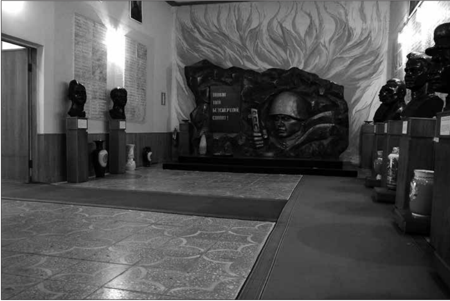
Figure 6. Museum of the 58 House of Officers (new PrikVO museum), hall with busts of Soviet Heroes, 2016.

and a bas-relief depicting a soldier with the epigraph “Your act of bravery is eternal, soldier!” The persons portrayed were not explained as part of the tour but could later be identified as nine Russian, one Belorussian, and two Ukrainian war heroes, several with the official title Hero of the Soviet Union. Illustrations in the old museum’s guidebook identify them as Soviet originals.