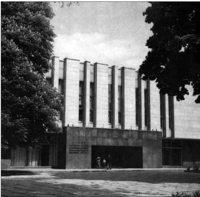
Figure 2. Museum of the History of the Carpathian Military District, postcard.

The PrikVO museum was first accommodated in a building at 99 Lenin Street (now Lychakivs'ka Street) and, on July 12, 1974, moved to a new building at 48a Stryis'ka Street that was specially designed for this purpose. The museum formed part of the new Soviet war memorial site in the upper area of the Park of Culture named after Bohdan Khmel'nitskiĭ, which included the Alley of Glory and the memorial To the Military Glory of the Red Army. Similar to the Monument of Victory in Leningrad, the ensemble was part of Soviet plans for a new city center and gateway towards the broad avenue leading to the Carpathian region. The museum was meant as the new city center's central focus point, the "opera house of this district," as the art historian Bohdan Shumylovych explained to us, replacing the bourgeois opera house from which political parades started. 6