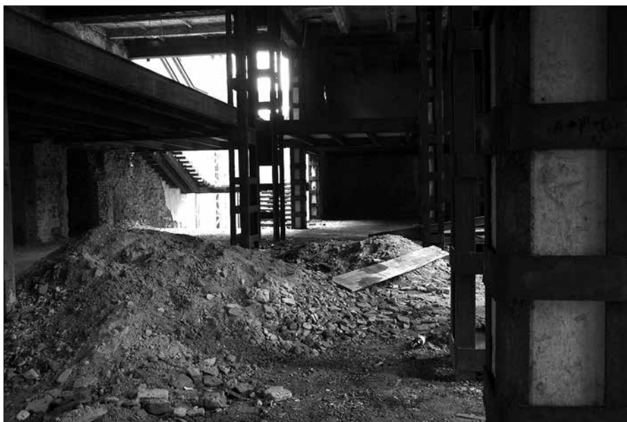
Figure 1. Museum of the History of the Carpathian Military District, 2016. Photo by the authors.

and ideological groups over the course of an entire commemorative calendar year, discussed ideas about the future representation of specifically local events during and in the aftermath of World War II with experts and passersby, and examined existing, demolished, and planned representations of the historical events in local museums. The collection of visual footage, interview recordings, photographs, archival material, and found objects serves as the basis for scholarly analysis and artwork that reflects on identity politics among different actors of memory.