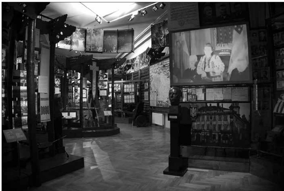
Figure 7. Museum of the Liberation Struggle of Ukraine, hall 2, 2016.

The new PrikVO museum used the original material without dismantling the Soviet master narrative. It painted it in yellow and blue where possible and added Ukrainian aspects. That it does not use more contemporary presentation techniques might be owed to the fact that it does not have the means of Soviet, contemporary Russian, or Western war museums. The MvbU presents a counter narrative to the former Soviet narrative and in doing so had to draw on different materials. Its wealth lies in the rich collection of documents and printed matter collected within Ukraine and by Ukrainians in the diaspora. Despite its rustic appearance resembling Eastern European post-Soviet interior design, the museum's presentation and objectives are strongly influenced by Soviet war museums.