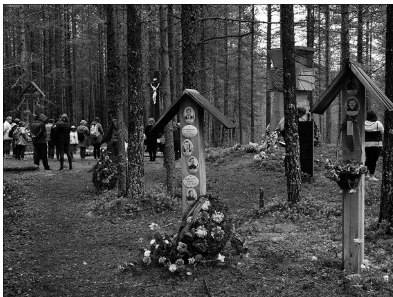
Figure 2. Sandormokh Cemetery in Karelia, the site of mass graves of the Great Terror 1937–1938.