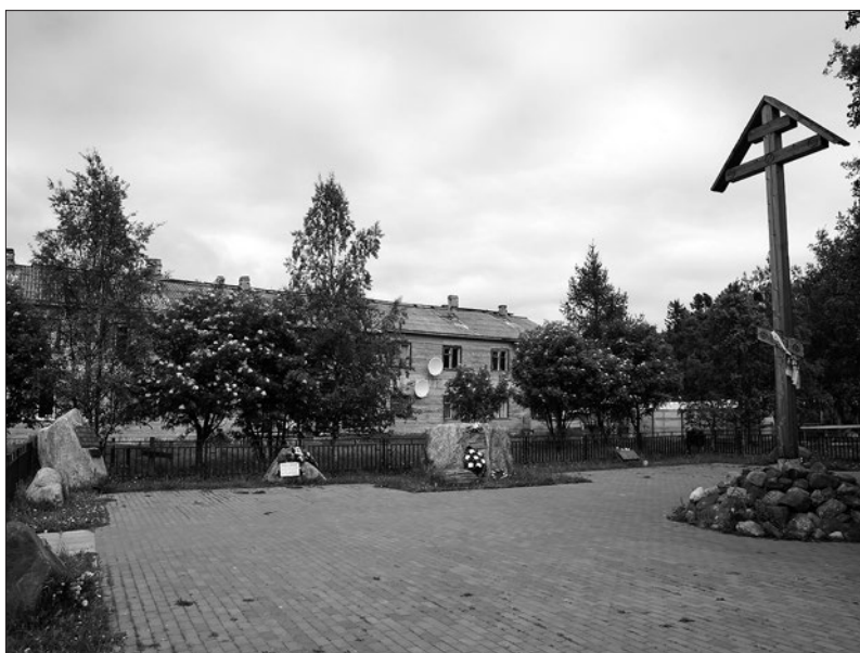
Figure 6. The Avenue of Remembrance on the Solovetskie Islands.