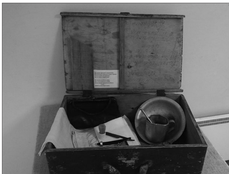
Figure 3. The temporary exhibition entitled Prisoner’s Suitcase prepared by the Medvezh’egorsk District Museum and presented on Solovki during the Days of Remembrance of the Victims of Political Repressions in July 2017.

Notably, the new interpretation of Soviet repressions as a heroic moment for the Orthodox clergy became part of a concept that went beyond the Solovetskii monastery-museum. This concept was also reflected in the temporary exhibition brought from the Medvezh’egorsk District Museum, dedicated to the Days of Remembrance of the Victims of Political Repressions that were organized by the museum in July 2017, instead of the Memorial-initiated Days of Remembrance. The exhibition, entitled Prisoner’s Suitcase , narrated about the construction of the White Sea–Baltic Sea Canal (Belomorkanal) (Figure 3). The usual Soviet narrative about the Belomorkanal, represented by numerous propaganda photographs and a screening of a 1932 Soviet film about the construction of the canal, was unexpectedly supplemented by some portraits of priests who died in the construction of the canal and who were subsequently recognized as new martyrs by the Russian Orthodox Church. This turn reflected the sensitivity of the organizers of the Medvezh’egorsk exhibition to the new reading of past repressions. The emergence of portraits of new martyrs at the exhibition about Belomorkanal was a reaction to the new trends in representing this theme.