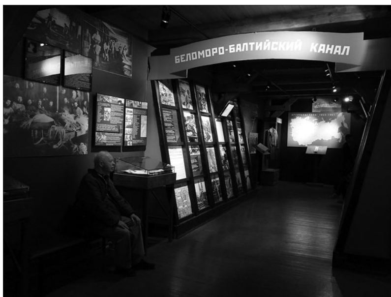
Figure 4. The exhibition on the Solovetskii Special Purpose Camp displayed in the former camp barrack on Solovki.